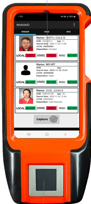
FAP30 LES Fingerprint Sensor