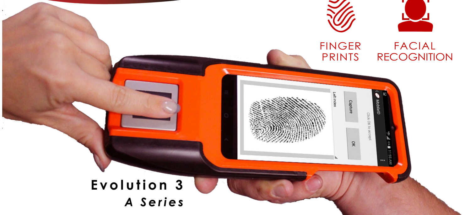
Evolution 3 A Series